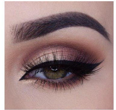
SHB20116 Certificate II in Retail Cosmetics