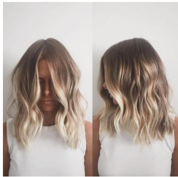
SHB30416 Certificate III in Hairdressing