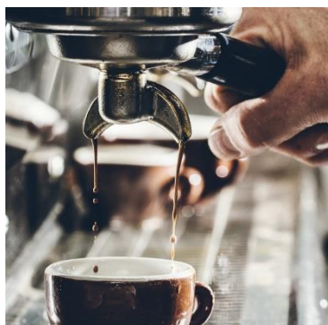
SIT20316 Certificate II in Hospitality