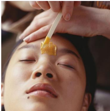
SHB30115 Certificate III in Beauty Services

All About Hair & Beauty Training currently offers courses in the following: