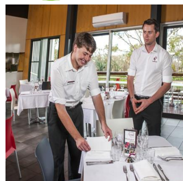
SIT30616 Certificate III in Hospitality

For further information on any of these courses, contact All About Hair & Beauty Training (07) 4927 4586 or drop into our training room at 39 Gladstone Road, Rockhampton Q 4700